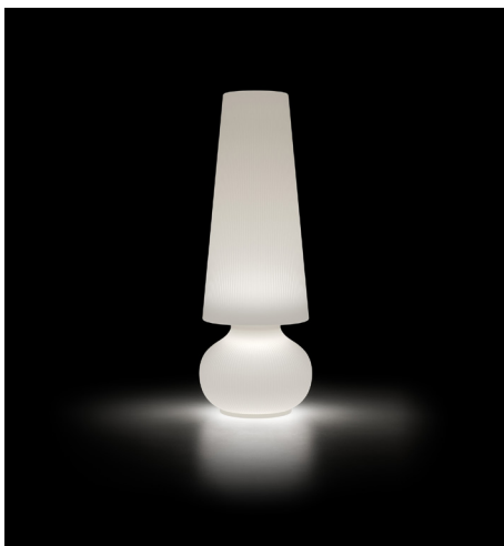
FADE LAMP M DISCOVER MORE