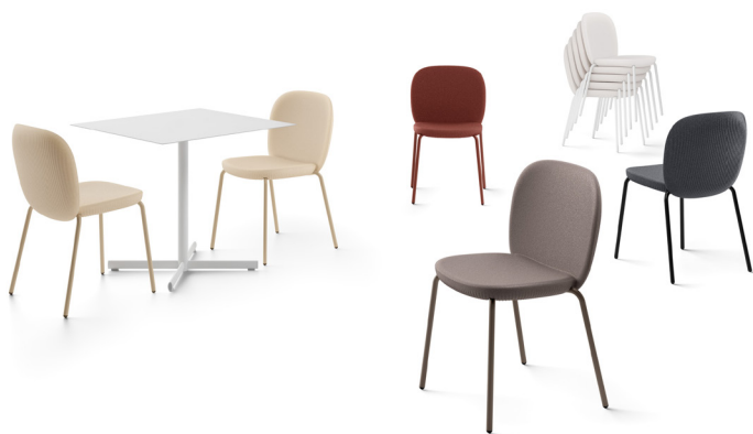
FADE STACK CHAIR DISCOVER MORE